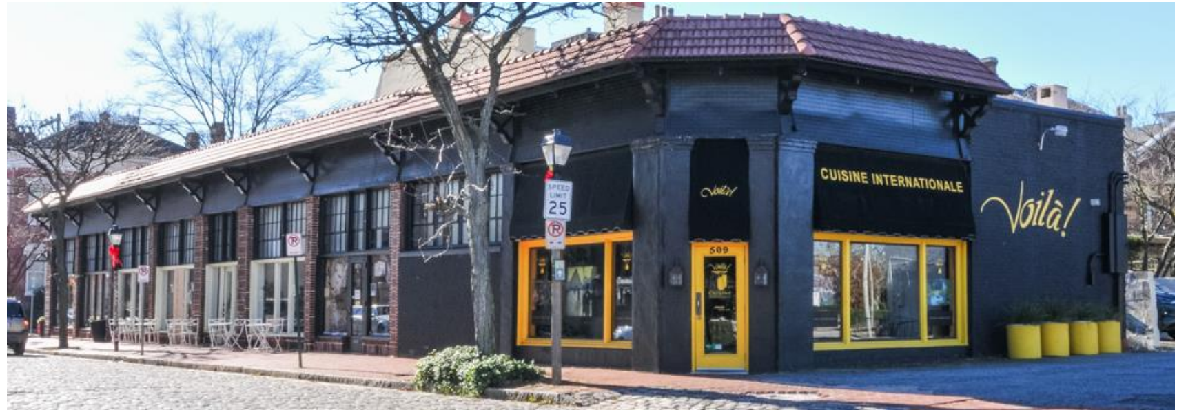
501-509 Botetourt Street

surveyNFK norfolk historic resource survey