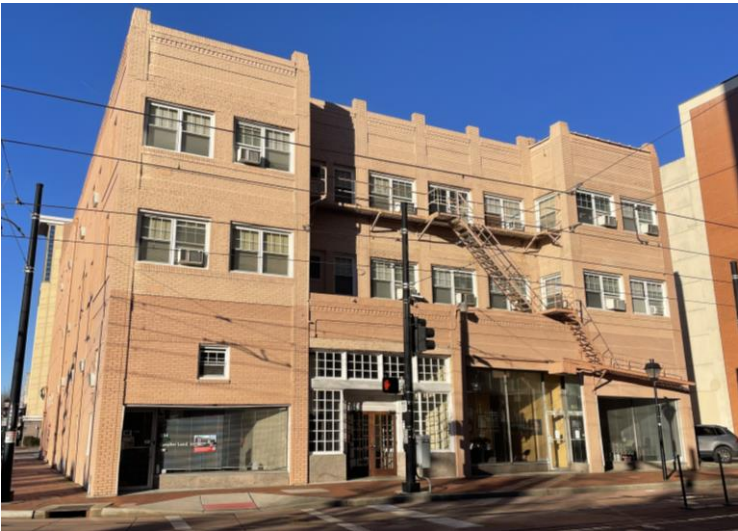
230 W Bute Street, ca. 1938