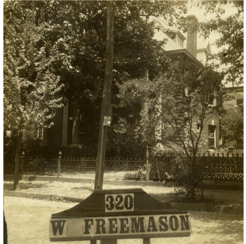
Historic Tax Assessor photograph.