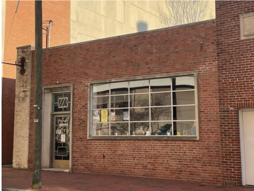
223 W York Street, ca. 1946