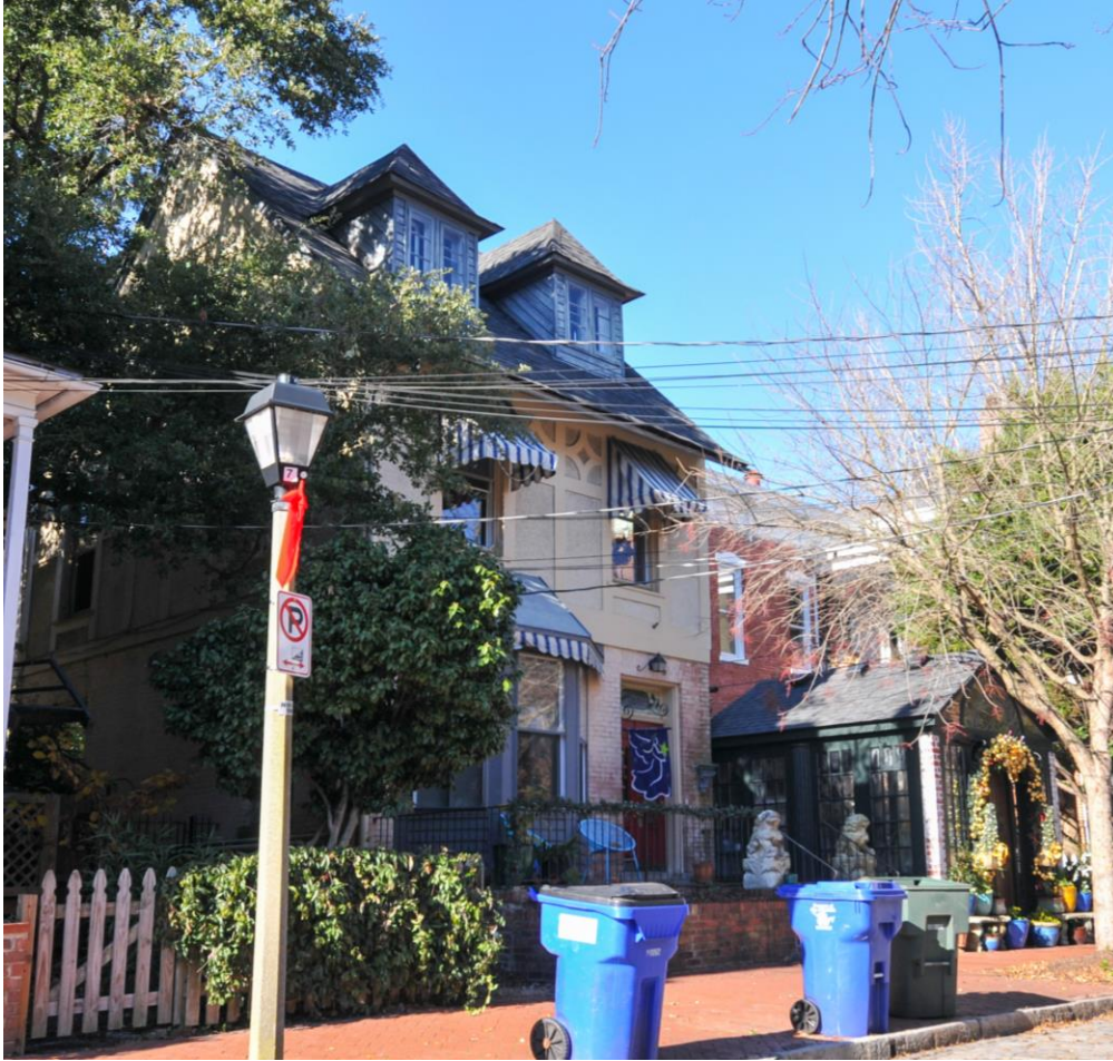
Photograph taken December 20, 2023.