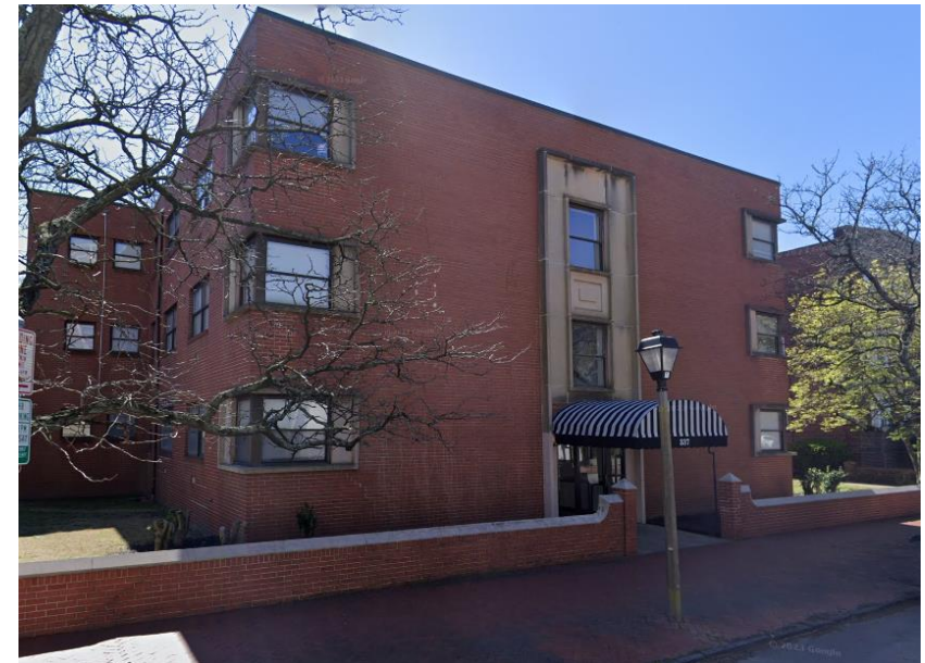
327 W Bute Street