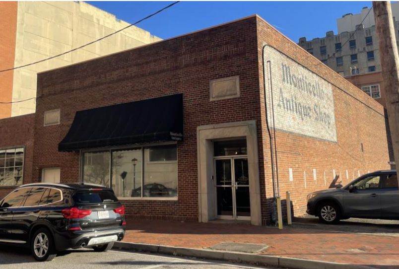
227 W York Street, ca. 1941